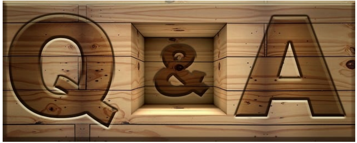
January and early February's webinar/Q&A sessions are: